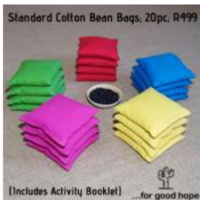
Standard 20pc; R499