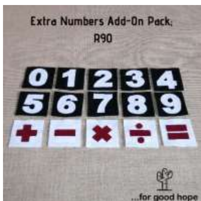
Numbers Add-On Pack; R90