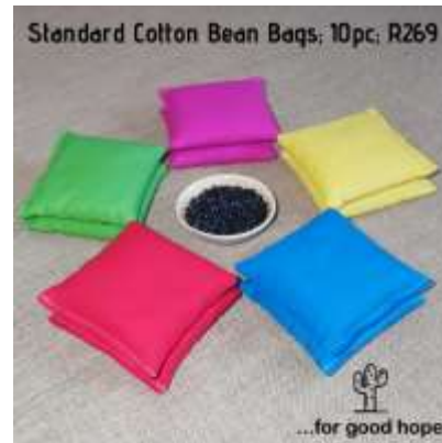
Standard 10pc; R269