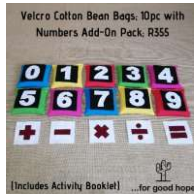
Velcro 10pc; with Numbers; R355