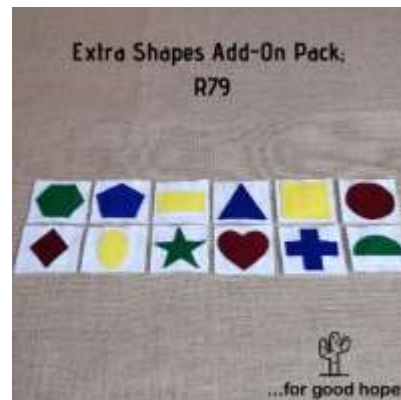
Shapes Add-On Pack; R79