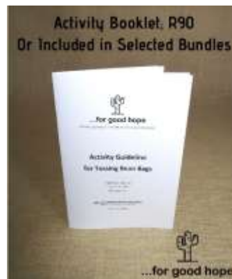
Activity Booklet; R90