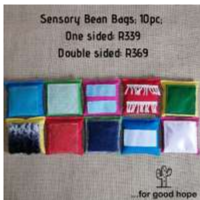
Sensory Bean Bags 10pc One Sided: R339; Double Sided: 369

Our Sensory Bean Bags are a must-have resource in every therapy room and home for individuals with sensory needs! Different fabrics are used on each Bean Bag to create sensory stimulation. They are great for children with sensory needs as well as for adults with advanced stages of Dementia.