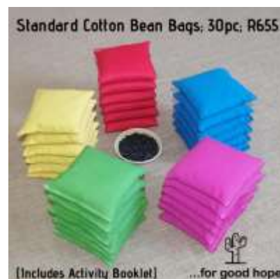
Standard 30pc; R655