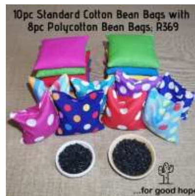
10pc Standard + 8pc Polycotton; R369