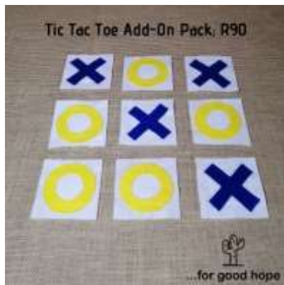
Tic Tac Toe Add-On Pack; R90