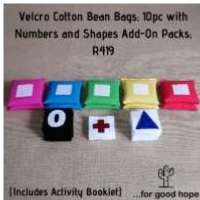
Velcro 10pc; with Shapes and Numbers; R419