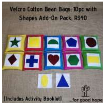
Velcro 10pc; with Shapes; R340