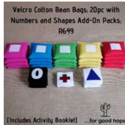
Velcro 20pc; with Shapes and Numbers; R649