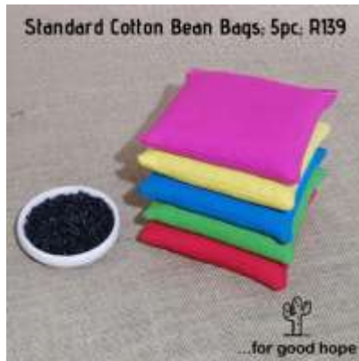
Standard 5pc; R139