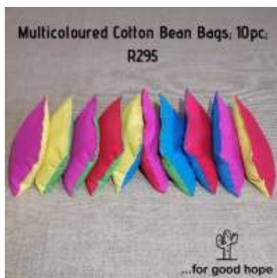
Multicoloured Cotton Bean Bags 10pc; R295